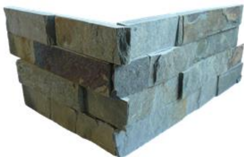
External corner example